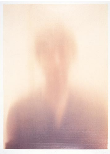
Rebecca Beardmore, Recognition , 2001, offset lithography, silkscreen, embossment, 85.7 x 66 cm.